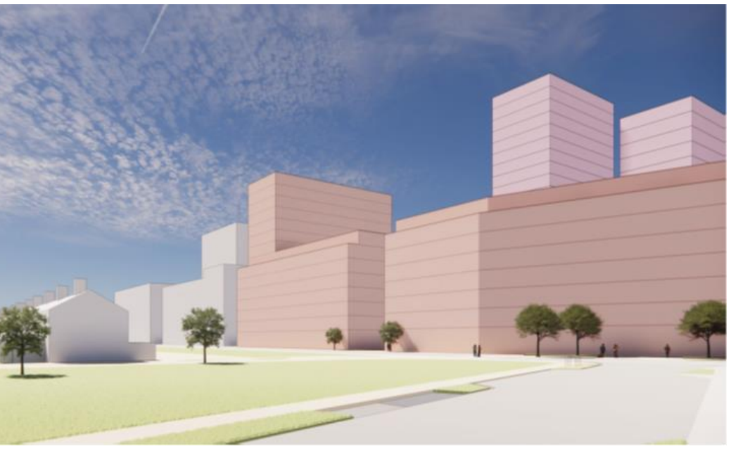
Plots 42-44 Massing Study